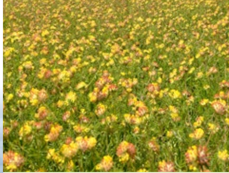
Kidney Vetch – larval foodplant of Small Blue

Refreshment Pubs and cafés in Winchester